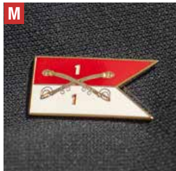
Cav flag pin