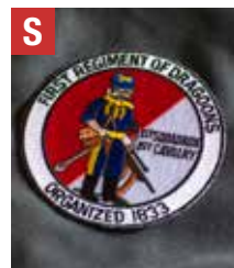
Old Bill patch