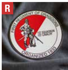
Old Bill magnetic decal