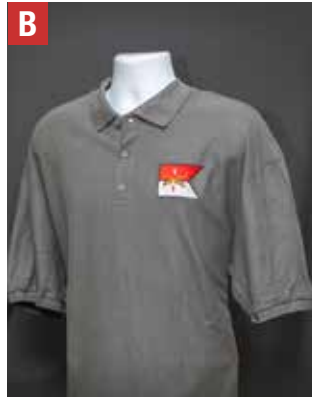
B Ash polo w/Cav flag