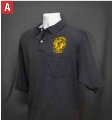
A Black polo w/Gold Insignia