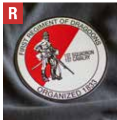
Old Bill magnetic decal