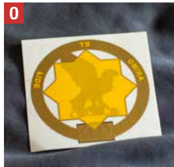
Crest window decal