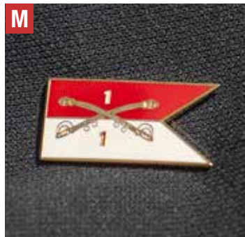
Cav flag pin