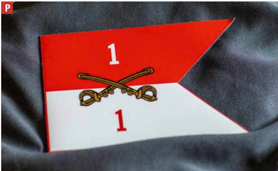
Cav flag magnetic decal