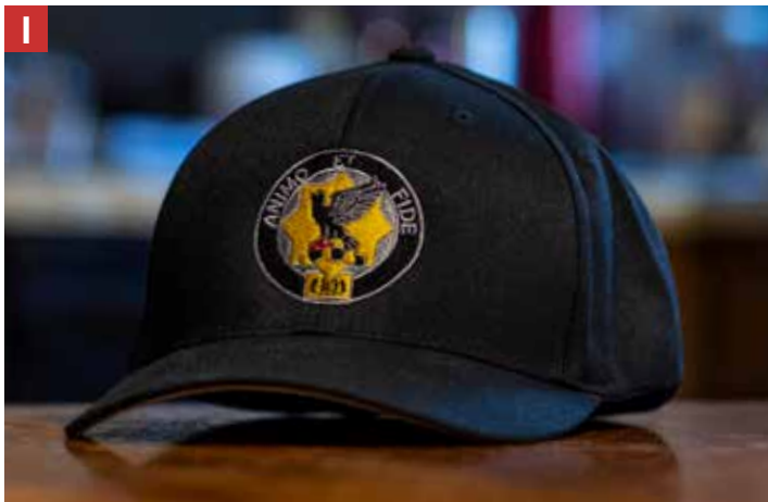
Black hat w/Silver Insignia