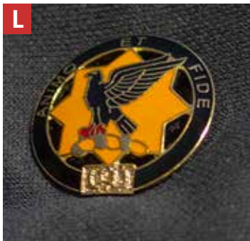
Blackhawk crest pin