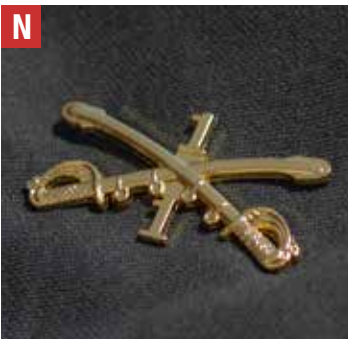
Crossed Sabres pin