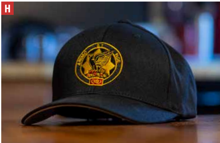
Black hat w/Gold Insignia