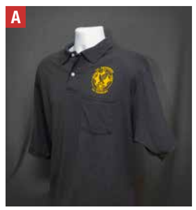
Black polo w/Gold Insignia