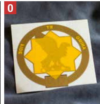
Crest window decal