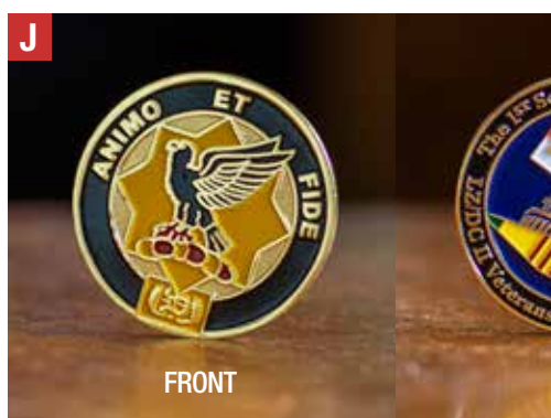
Cav 35th Veteran's Day coin