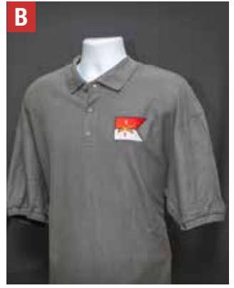
Ash polo w/Cav flag