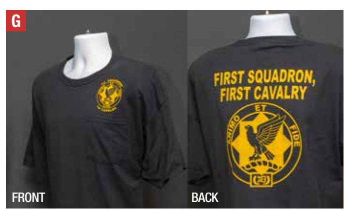
Pocketed black t-shirt with two Cav insignia