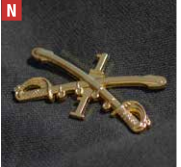
Crossed Sabres pin