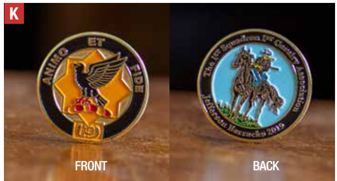
Old Bill Cav coin