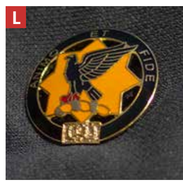
Blackhawk crest pin